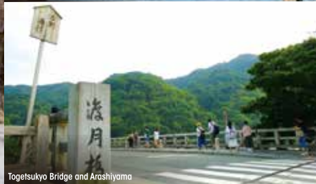
Togetsukyo Bridge and Arashiyama