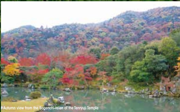
Autumn view from the Sogenchiji-temple of the Tenryuji Temple

※The inner part of Arashiyama National Forest has steep slopes, with a risk of falling rocks, so the public is not permitted to enter. Please enjoy the forest from outside, as a picturesque backdrop to Togetsukyo Bridge and temples such as Tenryuji.