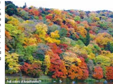
Fall colors of Arashiyama

While sugi, Japanese cedar ( Cryptomeria japonica ) and hinoki, Japanese cypress ( Chamaecyparis obtusa ) grow in some parts of the forest, it is mostly an old-growth natural forest, with maple ( Acer ); keyaki, zelkova ( Zelkova serrata ); cherry ( Prunus ); and arakashi, Japanese blue oak ( Quercus acuta ). In addition, akamatsu, Japanese red pine ( Pinus densiflora ) grow along the ridge line.