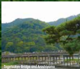
Togetsukyo Bridge and Arashiyama