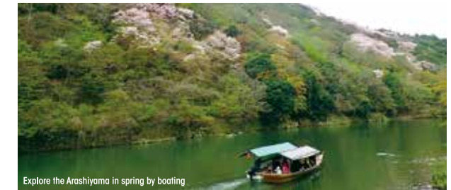
Explore the Arashiyama in spring by boating

Visitors can, of course, enjoy exquisite views of the harmonious scenery formed by Togetsukyo Bridge and Oi River against a backdrop of cherry blossom in Spring and scarlet and gold leaves in Fall. In addition, on the opposite bank of Oi River, Kameyama Park offers a panoramic vista of the beautiful Hozu Valley, which is said to remain virtually unchanged from the Heian period, over a thousand years ago. This area is also home to famous temples such as Tenryuji Temple, a World Cultural Heritage site and location of the notable garden Sogenchi-teien, which uses Mount Arashi as borrowed scenery. Visitors can encounter wild monkeys at Arashiyama Monkey Park Iwatayama, or take to the river in a hired boat or on a Yakatabune cruise to get a taste of what it was like to be a Heian period aristocrat.