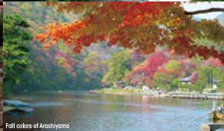
Fall colors of Arashiyama