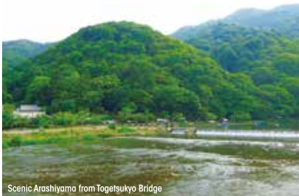
Scenic Arashiyama from Togetsukyo Bridge

Arashiyama Scenic Forest covers almost all of the forested area that can be seen upstream from Togetsukyo Bridge, on the right bank of the Oi River, which flows through western Kyoto City. The slopes are very steep, with an average grade in excess of 30°.