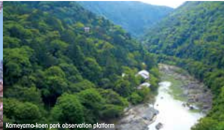
Kameyama-koen park observation platform