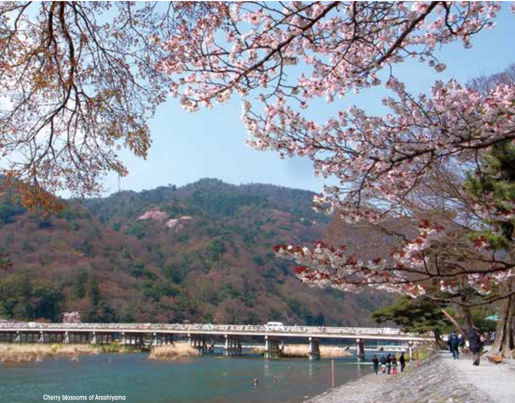
Cherry blossoms of Arashiyama