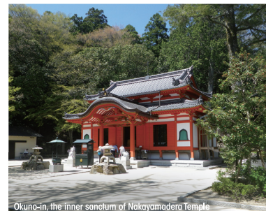
Okuno-in, the inner sanctum of Nakayamadera Temple

Nakayamadera Temple stands at the foot of the mountain. Visitors can pray there for the safe birth of a healthy child and the temple is crowded with visitors who come to receive "oharaobi" (maternity belts) on Inu no Hi ("dog day," a day to pray for safe and easy delivery) on the traditional Japanese calendar. Another historic site is Kiyoshikojin Seicho-ji Temple, the main temple of the Shingon Sambo sect of Buddhism, built more than 1,100 years ago at the command of Emperor Uda. Okuno-in, the inner sanctum of Nakayamadera Temple, stands near the center of the forest, about 50 minutes on foot from the main hall of Nakayamadera Temple.