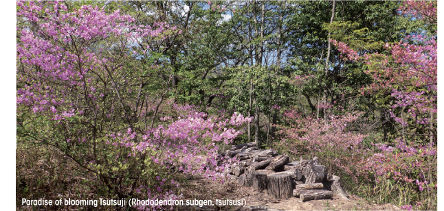
Paradise of blooming Tsutsuji (Rhododendron subgen. tsutsusi )

The area has a temperate Seto Inland Sea climate. It is a natural forest mainly consisting of broad-leaved trees. Along the mountain trails, tall deciduous trees including Irohamomiji (Japanese maple ( Acer palmatum Thunb.)) and Konara ( Quercus serrata ) and plants such as Tsutsuji (Rhododendron subgen. tsutsusi ), Nejiki ( Lyonia ovalifolia ssp. Neziki ) and Natsuhaze ( Vaccinium oldhamii Miq.) thrive. In spring, cherry ( Prunus ) trees captivate visitors to Meoto-iwa Enchi and Yasuragi Hiroba.