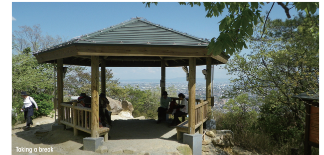
Taking a break

The Takarazuka Recreation Forest is conveniently located near an urban area in Takarazuka City which has a population of 200,000 people. With mountain trails criss-crossing the forest, it is a popular outdoor spot that families can easily visit.