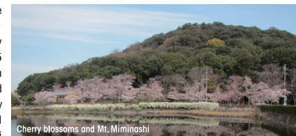
Cherry blossoms and Mt. Miminashi

Kashihara City has a warm temperate zone climate, with an average temperature of 15.3°C and relatively high average annual rainfall of 1765 mm. Vegetation in the Yamato Sanzan includes Konara ( Quercus serrata ) and Ryobu ( Clethra barbinervis ), but it mostly consists of evergreen broad-leaved forests consisting mainly of Arakashi (Japanese blue oak ( Quercus acuta )) and Shirakashi ( Quercus myrsinaefolia Blume).