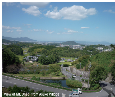
View of Mt. Unebi from Asuka Village

Yamato Sanzan collectively refers to three mountains that rise in the Asuka region at the southern end of the Nara Basin in Nara Prefecture: Mt. Kaguyama (152.4 m) in the east, Mt. Unebi (199.2 m) in the west and Mt. Miminashi (139.7 m) in the north. They are noted for their beautiful shapes. Mt. Unebi and Mt. Miminashi are both volcanic peaks, but Mt. Kaguyama is said to have originally formed part of a ridge extending northwest from Mt. Tono-Mine which eventually gained the shape of a single peak through weathering and erosion.