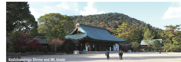
Kashiharajingu Shrine and Mt. Unebi

Yamato-yagi Station (about 2.7 km) → Mt. Miminashi (about 2.0 km) → Fujiwara Palace Ruins (about 2.1 km) → Mt. Kaguyama (about 1.4 km) → Kashihara Insect Museum (about 1.2 km) → Honenji Temple (about 1.4 km) → Ruins of Moto-Yakushiji Temple (about 1.4 km) → Emperor Jimmu Mausoleum (about 1.5 km) → Mt. Unebi (about 0.5 km) → Kashiharajingu Shrine (about 0.8 km) → Kashiharajinja Shrine mae Station (Entire course: about 15.0 km)