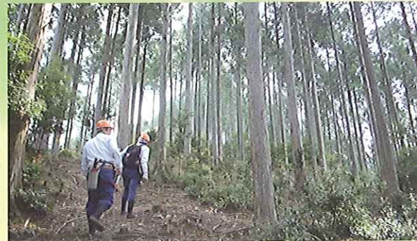
Former seed production forest

Please use the trail at your own risk, since the trail is developed for business use.