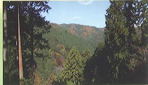
View from observation point