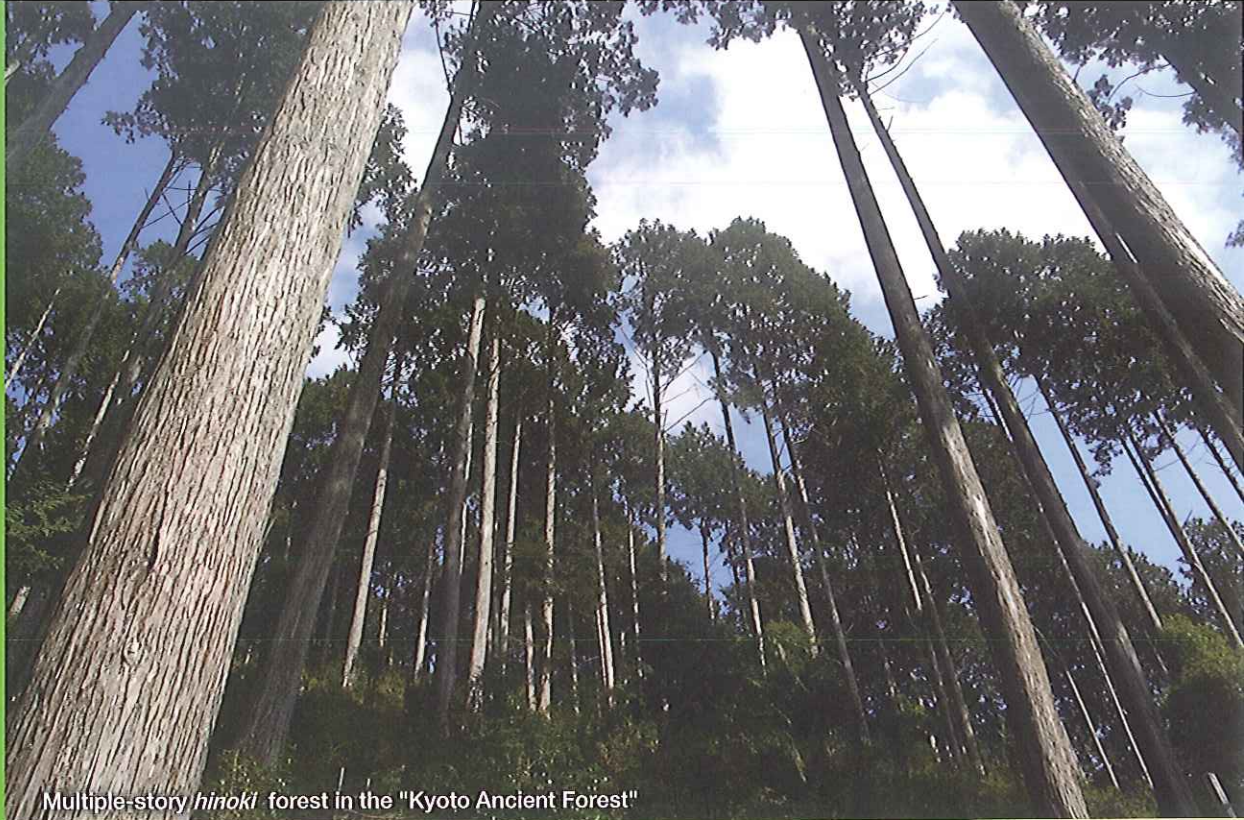
Multiple-story hinoki forest in the "Kyoto Ancient Forest"

Recently, large diameter timber used for traditional wooden buildings is becoming scarce due to the exploitation of global forest resources. Therefore, the "Council for the Kyoto Ancient Forest" established the "Kyoto Ancient Forest" with the management period of hundreds of years for the provision of large diameter timber, in cooperation with the Kyoto-Osaka District National Forest Office, in 2002 and 2003.