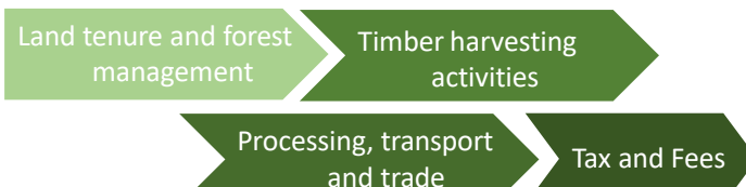
Four clusters of GLEs