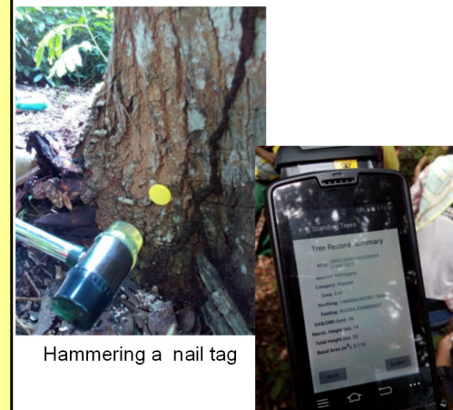
Hammering a nail tag