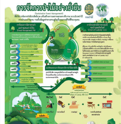
An infographic developed by the project illustrating the seven Thai C&I