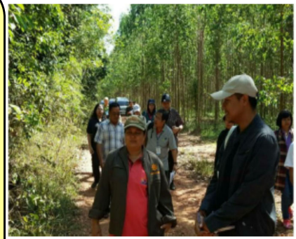
Field work in the Training on C&I and CoC in Nan province