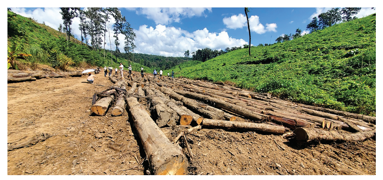
Teak logs in the Kroweng Krawia plantation, Kanchanaburi Province of Thailand, destined for the domestic market.

5. Reducing the flammability of wooden buildings to acceptable levels—at par with buildings that use other materials—will require both technological solutions and the upgrading of municipal fire-safety measures, as has been done (for example) in Finland and Japan. The speed at which such improvements are made can be increased through technological collaboration among countries, as provided for in the technology framework referred to in Article 10.4 of the Paris Agreement on climate change.