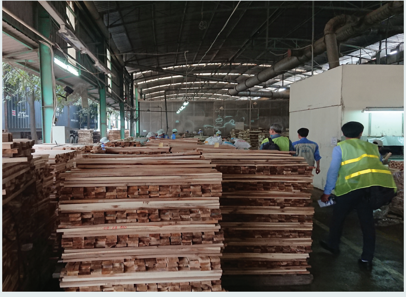
Processing acacia sawnwood in Viet Nam.

17. Awareness campaigns. Prolonged and imaginative public-awareness campaigns, directed towards children and young adults, are needed in both producer and consumer countries to emphasize the importance of legal and sustainably harvested timber. Young people are often able to influence the purchasing decisions of their parents and therefore informing them about ecolabels and timber legality certificates could have a powerful effect on the development of environmentally friendly domestic markets.