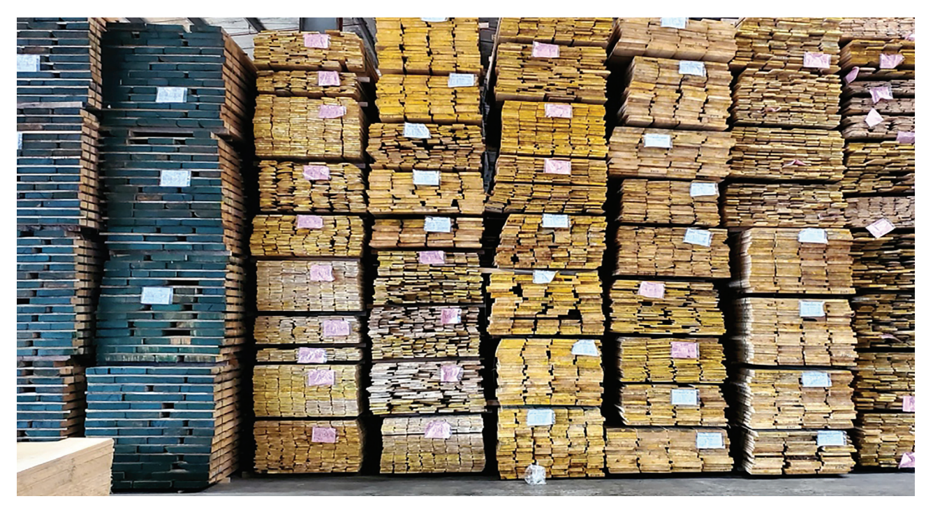
Stacks of sawnwood for the domestic market in a factory in Viet Nam.