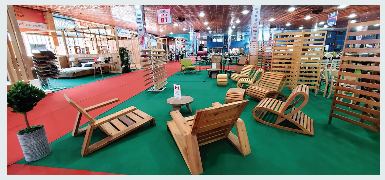
Furniture fair aimed at the domestic market in Viet Nam.

The world needs materials that are low-carbon, reusable and recyclable and which can be disposed of without contributing to the planet's pollution burden. One such material—and arguably the best—is wood.<sup>1</sup>