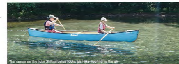
The canoe on the lake Shikaribetsu looks just like floating in the air