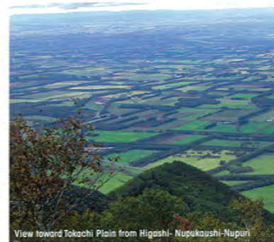
View toward Tokachi Plains from Higashi-Nupukaushi-Nupuri