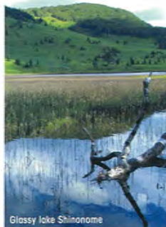
Glassy Lake Shinonome

Shikaribetsu Recreation Forest stretches out from the shores of Lake Shikaribetsu, in the south of Daisetsuzan National Park. The area is home to the Shikaribetsu volcanic group, whose peaks stand around 1,200 m high, as well as Lake Shikaribetsu, the highest lake in Hokkaido, which was formed tens of thousands of years ago when volcanic activity dammed the river. The volcanic group emerged during the last glacial period, when the climate was colder than it is now. Around their rocky slopes are air holes through which a cold wind blows, even in summer, and permafrost soil, sediment or rock that remains frozen all year round — has been found underground. Other features of this area's unique topography and landscape include hot springs, which are one of the benefits of volcanoes; a river delta that is still in the process of being formed even now; and Lake Shinonome, famed as one of Hokkaido's top three little-known lakes.