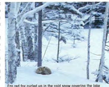
Ezo red fox curled up in the cold snow covering the lake

In winter, the temperature plummets to -30^{\circ}\text{C} or lower, while even in summer, it can drop to almost 5^{\circ}\text{C} . This is the only natural lake in Daisetsuzan National Park. The Miyabeiwana ( Salvelinus malma s.m. miyabei ) is a subspecies of Oshorokoma (Dolly varden) that was uniquely evolved in this unlocked lake and lives here exclusively. The forest of Shikaribetsu provides a habitat for precious plants and animals such as pika ( Ochotona hyperborea yessoensis ), and is also designated as one of the 25 "important moss-forests of Japan" by Bryological Society of Japan.