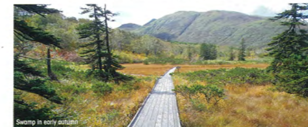
Swamp in early autumn

There is a walking trail with boardwalks, which even people without any mountain-climbing experience can walk on, goes around within the district, enabling visitors to enjoy trekking along the ponds. However, please note that this district is accessible only in summer, because winter brings heavy snowfalls and the roads including Pref. Route 66 are closed to traffic.