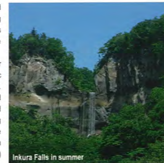
Inkura Falls in summer

In this area, the abundant underground water has slowly percolated through the thick volcanic ash layers that have accumulated from Mt. Tarumae's past eruptions, leaving it clean and clear. Evergreen trees such as Ezomatsu and Todomatsu and broad-leaved trees including Nara (oak ( Quercus )), Itaya (painted maple ( Acer mono Maxim. )), Katsura ( Cercidiphyllum japonicum Siebold et Zucc. ex Hoffm. et Schult.) and Harunire (Japanese Elm ( Ulmus davidiana var. japonica )) grow on the surrounding cliffs and gorges. The clear surface of the water reflects their changing seasonal colors.