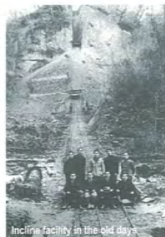
Incline facility in the old days

Inkura Falls is said to have been named after a facility called an incline* that was at one time installed on the Shadai Plateau to transport timber from trees such as Ezomatsu (Yezo spruce ( Picea jezoensis )), Todomatsu (Todo fir ( Abies sachalinensis )) and Mizunara (Japanese oak mizu-nara ( Quercus crispula Blume)) to the bottom of the steep cliff. *A system that made use of the weight of downward moving loaded handcars to raise unloaded handcars. As the incline was difficult to operate, it was closed, and the equipment was removed in 1944. Since then, timber has been transported using forest roads.