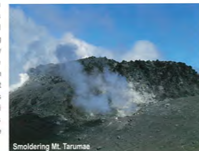
Smoldering Mt. Tarumae

There are also a variety of tourist sites nearby, such as the National Ainu Museum and Park (to open in 2020), which introduces Ainu culture, Mt. Tarumae, with its mountain hiking trails, a broad range of food-related spots offering local specialties made from freshly harvested ingredients and the Kojohama Onsen hot springs, which boast some of the most plentiful hot spring water in Hokkaido. Foodies can try the exquisite local Shiraoi Beef—world renowned for its smooth, rich flavor—for reasonable prices at restaurants in the town.