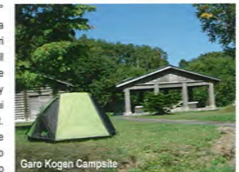
Garo Kogen Campsite