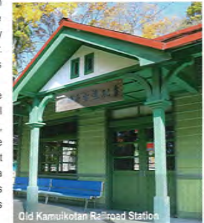
Old Kamuiotan Railroad Station

At the Arashiyama & Kamui Recreation Forests, visitors can hike (the Kamui iwa Hiking Course takes 90 minutes and the Kamui Hiking Course 120 minutes on foot), explore nature and go on quests for legends and remnants of the past. Particularly, in the Kamuiotan Gorge, the Ishikari River channel suddenly narrows and becomes wild and up to 70 m deep. Boats often overturned here in the past. According to legend, the Ainu people feared this to be the work of a demon living in the gorge. Along the riverbank, you can see "Kamuiotan pot holes" (designated a cultural property by Asahikawa City) formed through erosion by the river. These holes, which are said to be the "demon's footprints," have diameters of up to 5 m. The Specimen Forest District has the Foreign Tree Specimen Forest, which formed the setting of novel "Hyoten" ("Freezing Point") by the late Ayako Miura, who was born in Asahikawa City. Visitors can observe various precious trees, including eastern white pine, that were planted in 1898. In addition, the adjacent Miura Ayako Literature Museum displays various documents and materials concerning Ayako Miura and also holds special exhibitions.