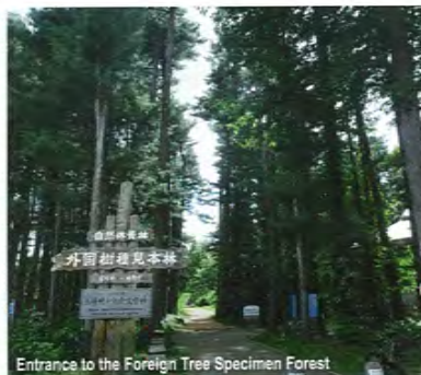
Entrance to the Foreign Tree Specimen Forest

The Arashiyama and Kamuiotan Districts are located in a hilly area, and visitors can easily have picnics and explore nature in Arashiyama Park and Hoppo Yasoen, etc. The Arashiyama Observation Platform, at an elevation of 253 m, offers panoramic views of the magnificent Taisetsuzan Mountain Range, the Ishikari River and the Asahikawa city area. It is also a popular night view point. In contrast, the Specimen Forest District is located on flat land near an urban area. Due to its accessibility, it is loved by locals as a place of recreation and is also visited by many tourists.