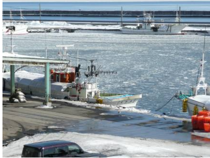
View of Rausu Port