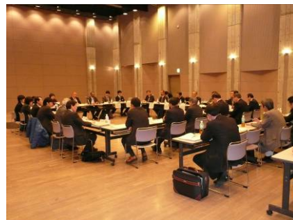
Meeting with local stakeholders