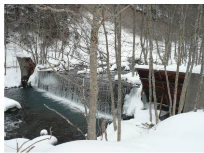
Unmodified dam on Iwauketsu River