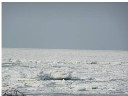
Sea-ice formation off Shari Town