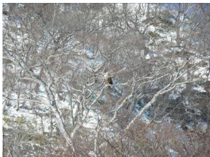
White-tailed Sea Eagle