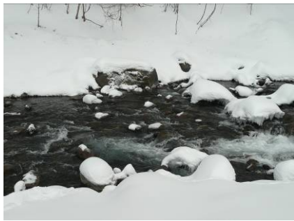
Modified dam on Iwauketsu River